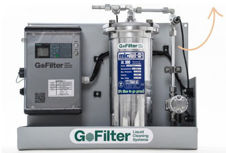
GOF 1800 exclusive