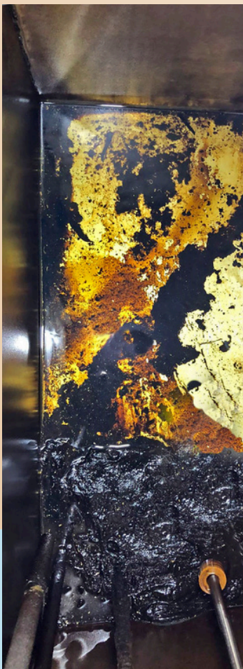
Contaminated fuel tank