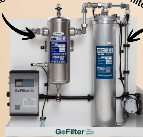
GOF 3000 exclusive plus (1080l/h , 285 GHP)