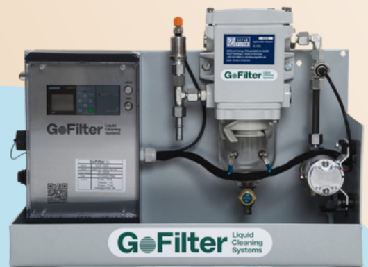
GOF 1800 with Separ 10 \mu\text{m} filter (600l/h , 160GHP)