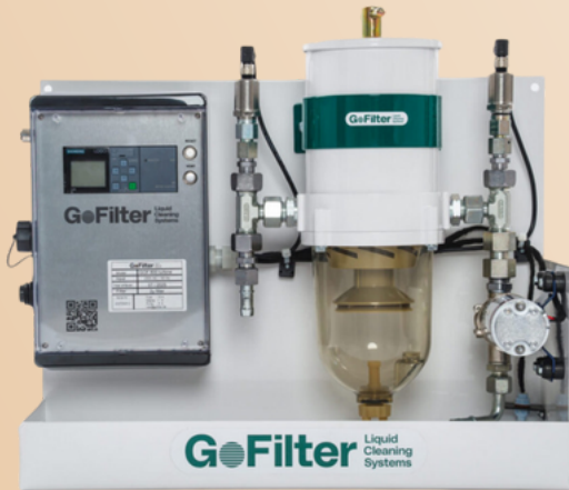
GOF 800 turbine with 2 \mu\text{m} filter (300l/h , 80GHP)

Reliable engines, clean tanks and maximum safety on board.